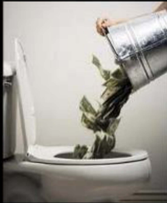
What Finance thinks I do