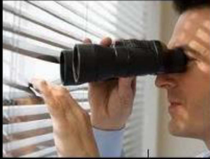
What my colleagues think I do