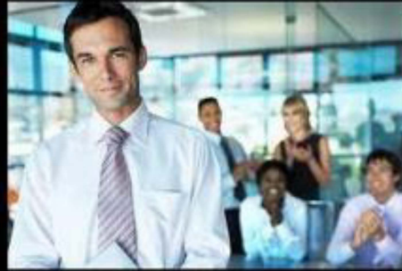
What my parents think I do