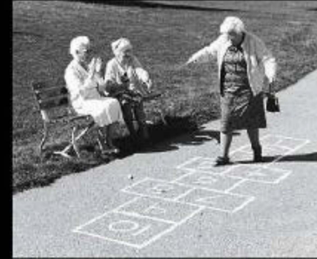
What the CEO thinks I do