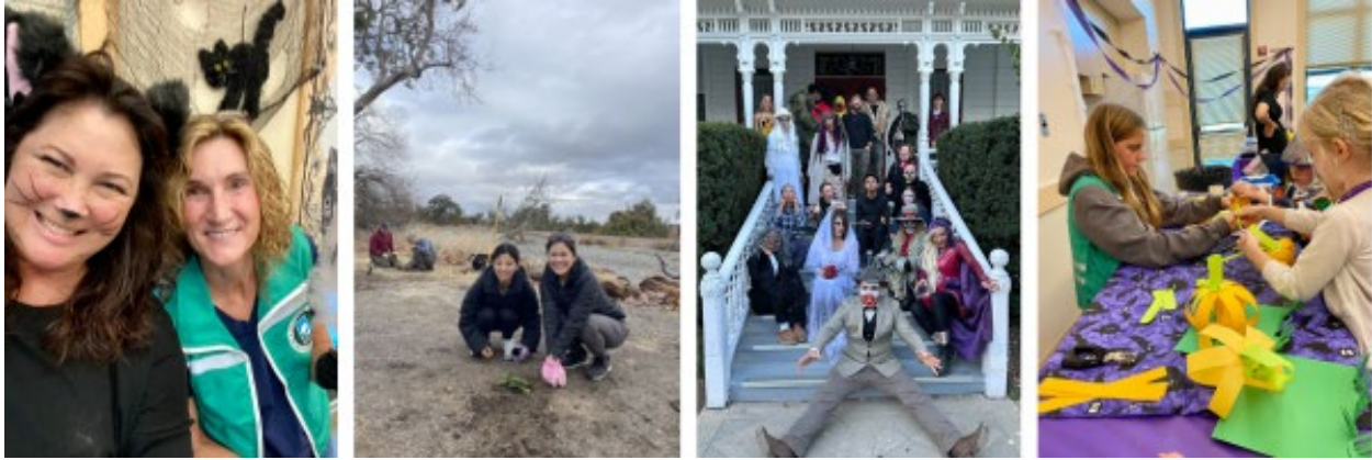
(Volunteers in action throughout the District)