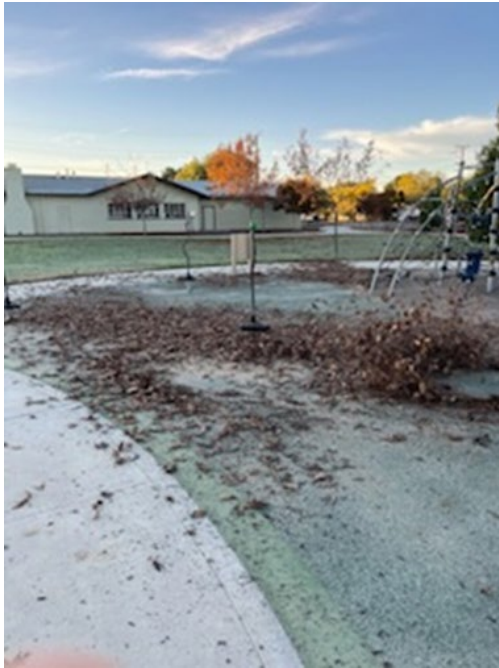
Leaf Clean Up at Bothwell Park