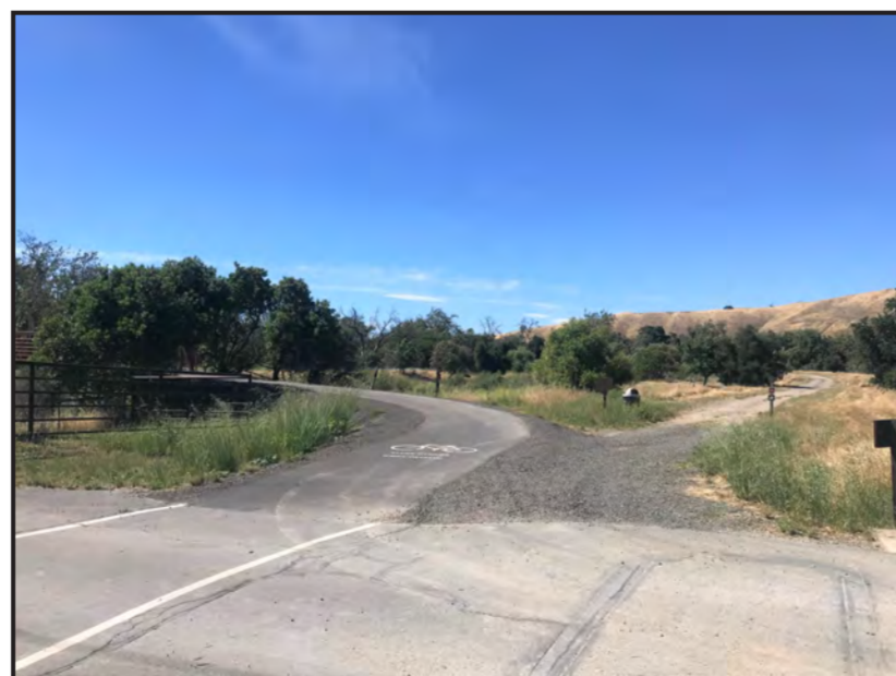
E Trail end