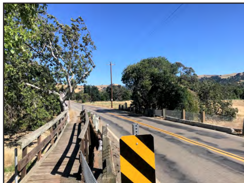
C Bridge to be replaced by Alameda County