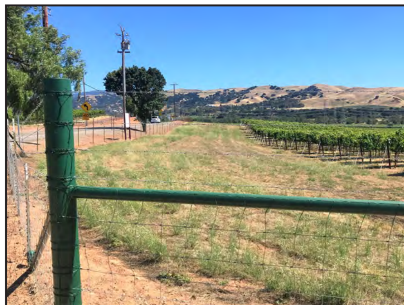
A Trail start