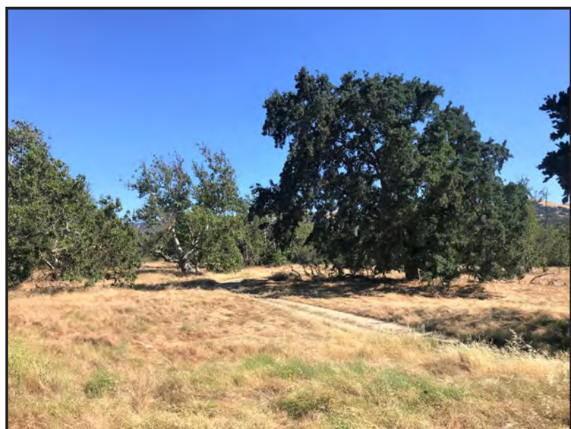
D LARPD property - Sycamore Grove Park