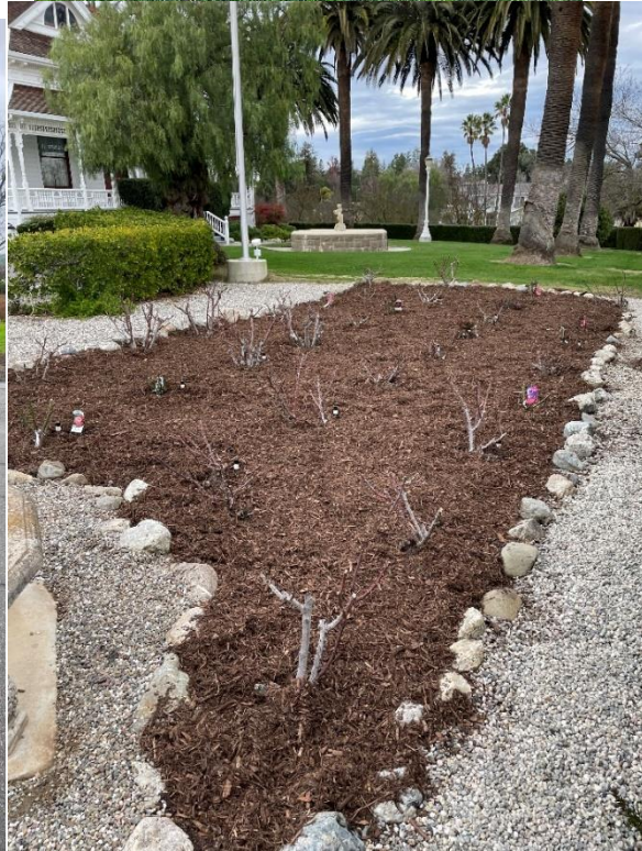
Ravenswood Historic entrance