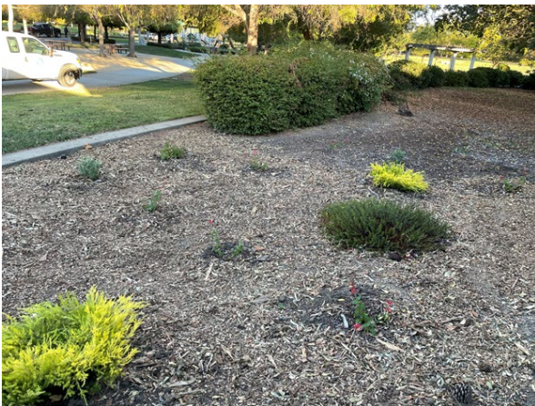
Shrubs planted at Bruno

Mechanic's Shop: This month, the shop handled essential vehicle and equipment repairs, alongside maintenance and training activities. Key vehicle services included multiple road calls for V29 (stuck in mud at various sites), new vehicle prep for 27BQ4Q, and tire services across units. For mowers and tractors, maintenance highlights involved blade sharpening, hydraulic services, and a water pump belt replacement on E086 due to overheating. Small equipment repairs included replacing E075's fuel pump and air filter. Additional tasks included shop maintenance, inventory management, employee and ranger training, and logistics trips for equipment fittings and trailer pickups.