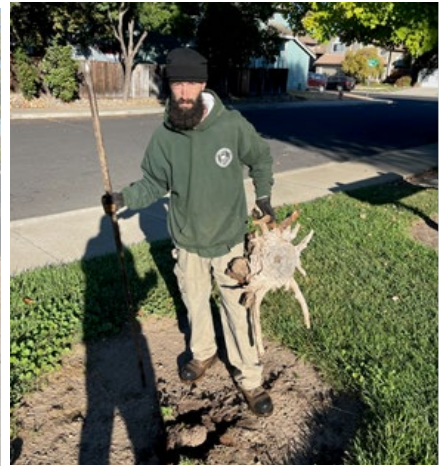
Tree Health Improvement Plan: Mulched tree wells via soil amendments for all trees.