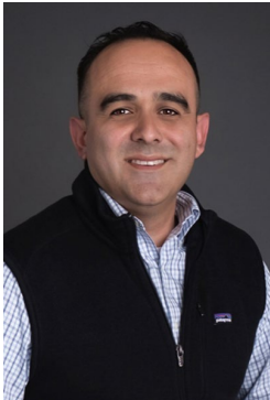
Erasmo Viveros Central Network