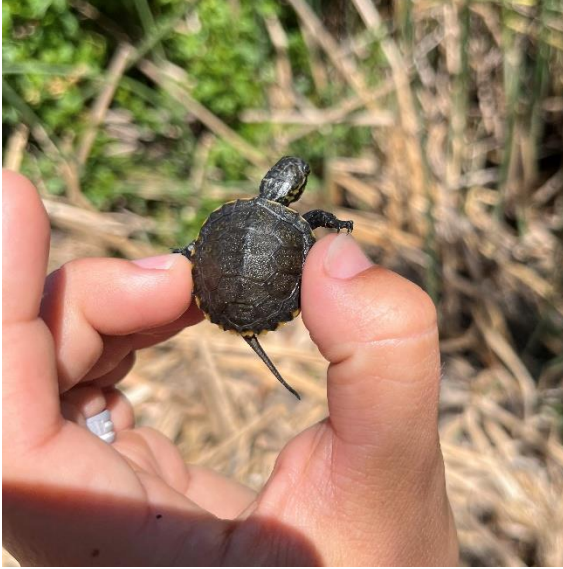
PHOTO: Native Western Pond Turtle hatchling at Cattail Pond